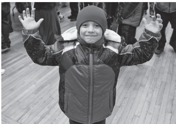
A young boy proudly displays his new winter coat, one of hundreds given to children in need throughout the country on Black Friday, Nov. 27.