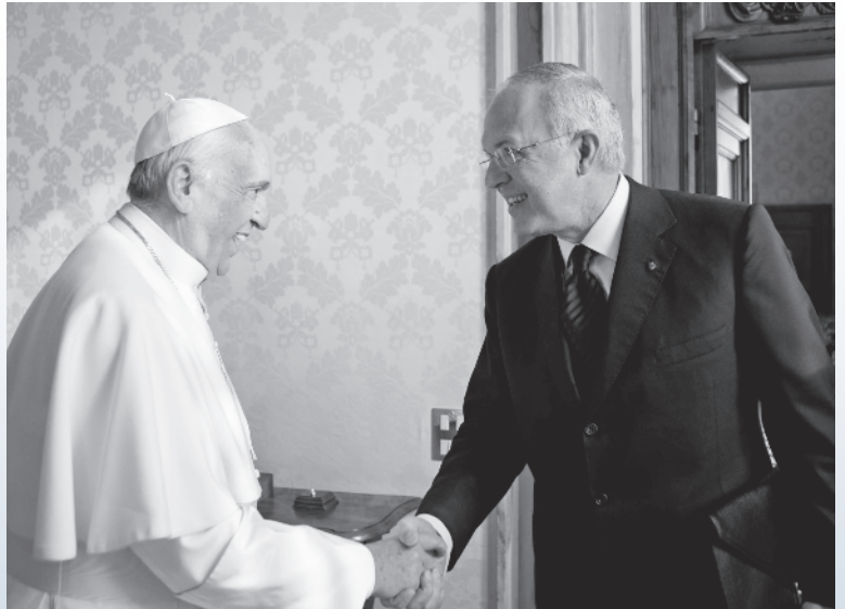
Pope Francis meets with Supreme Knight Carl Anderson at the Apostolic Palace, Dec. 17. There, they discussed the activities of the Knights of Columbus, including its support of persecuted Christians in the Middle East.

During the visit, the supreme knight presented the Holy Father with a contribution of $1.6 million from the Vicarius Christi Fund, offered on behalf of the 1.9 million members of the Knights of Columbus. The Vicarius Christi Fund has generated $56,015,000 for the pope's personal charities and causes since its establishment in 1981.